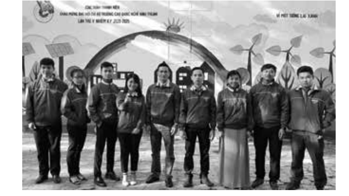
THE YOUTH UNION OF BINH THUAN VOCATIONAL TRAINING COLLEGE