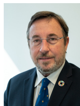
Achim Steiner, Administrator, United Nations Development Programme (UNDP)

I invite you to read the strategy and learn more. With the support and collaboration of our partners from the UN family -- including our close partnership with UN Women -- and beyond, UNDP will continue to take action with countries and communities to expand people's choices and realize a just and more equal world.