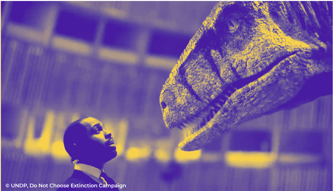
© UNDP, Do Not Choose Extinction Campaign

Climate finance for gender equality. While climate finance can achieve both climate and gender equality goals, only a small share goes to gender equality. UNDP will tap its partnerships with multilateral climate funds to advance practices that raise the bar, such as through required and rigorous gender analysis in designing and financing initiatives and mechanisms to routinely bring women’s organizations into decision-making on project development, implementation and evaluation. UNDP will work with the funds to explore modes of finance more accessible to smaller women’s organizations.