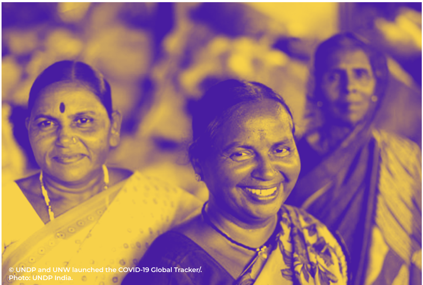
© UNDP and UNW launched the COVID-19 Global Tracker/. Photo: UNDP India.

In this context, UNDP is uniquely capable of taking a whole-of-society approach and helping governments expand national development choices that work for all. Over the past 56 years, UNDP has generated credibility and trust. Our presence in 170 territories across the humanitarian-development nexus provides an unparalleled 360-degree view of society in the countries where we operate. This gender equality strategy calls for taking ambitious actions, gender equality is among the most important contributions to human and sustainable development that UNDP as an organization can make.