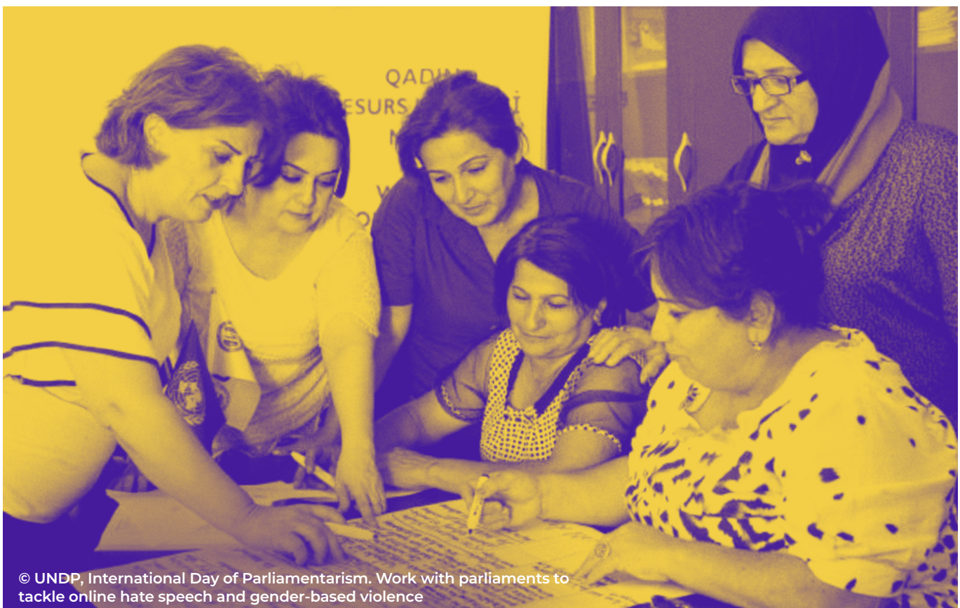
International Day of Parliamentarism. Work with parliaments to tackle online hate speech and gender-based violence

Achieving gender justice to realize rights. The UNDP Global Programme on Strengthening the Rule of Law and Human Rights emphasizes gender justice in supporting over 48 countries and contexts affected by crisis, fragility or conflict. With partners such as UN Women, and through initiatives such as the 'Gender Justice Platform', UNDP will provide continued technical, financial and policy support on links between gender equality and legal protection, gender-responsive justice, security sector reforms, legal aid services, transitional justice and constitutional reforms. More systematic work with men, especially in