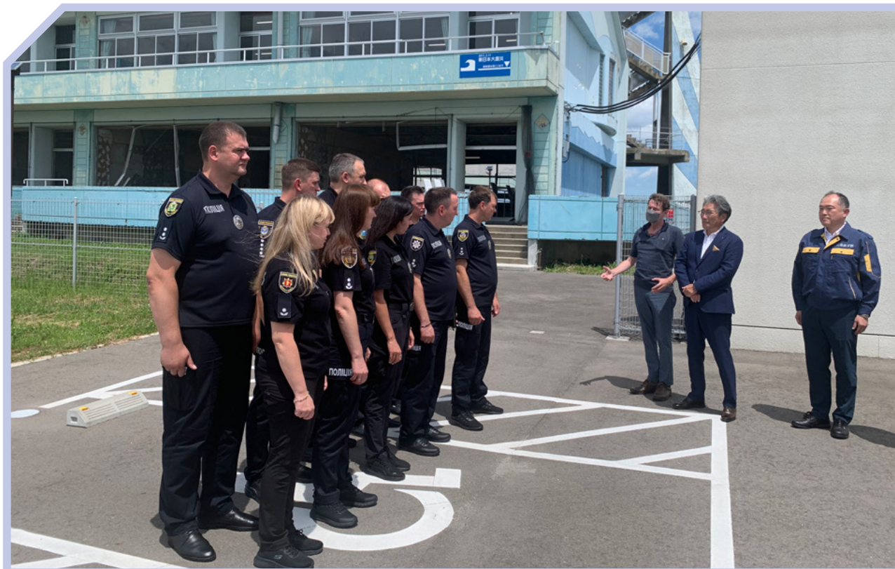
Ten forensic specialists from the National Police of Ukraine visited a school ruined in the Great East Japan Earthquake of 2011 in Fukushima Prefecture, Japan, in July 2023.

25 forensic experts from the Ukrainian National Police participated in the knowledge exchange study tour to Japan (Tokyo and Fukushima) to enhance their knowledge about forensic investigations of war-related crimes.