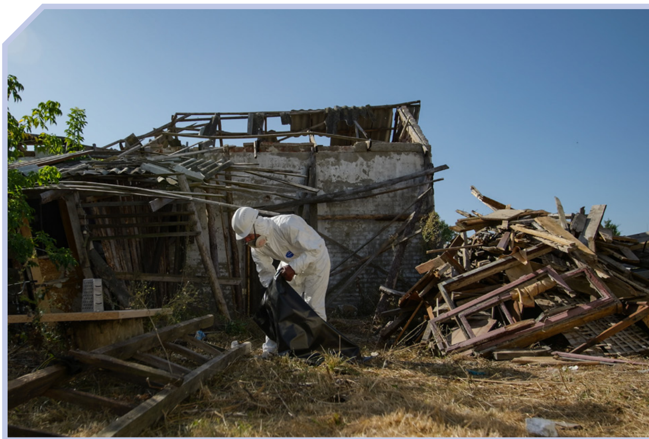
A debris removal worker in a specialized protective uniform collects asbestos-containing materials from the yard of a destroyed house, Kyiv Oblast – August 2023.

UNDP is supporting local authorities in establishing an effective debris management system, which consists of the following steps: