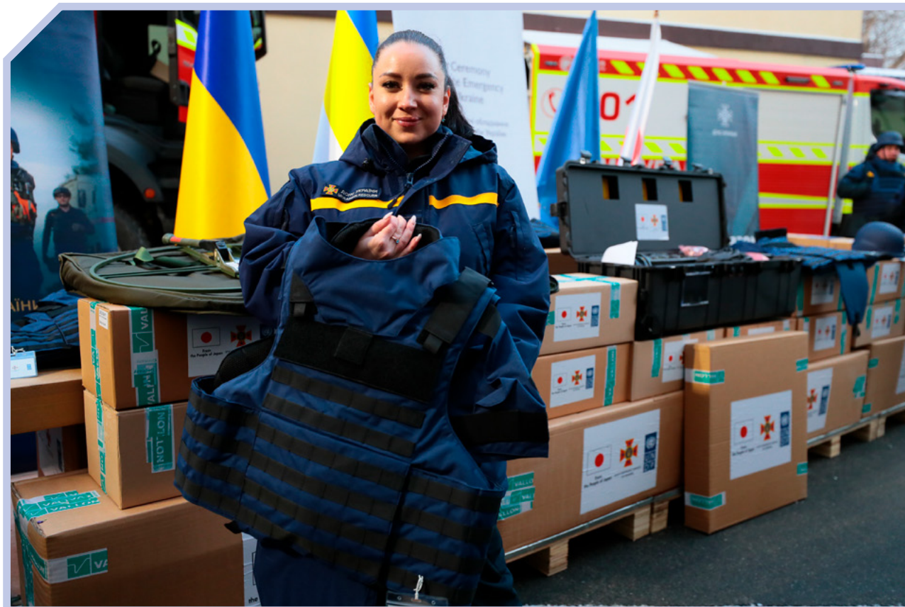
A worker of the State Emergency Service of Ukraine at a handover ceremony for demining and protective equipment, Kyiv – January 2023.

UNDP is bolstering the demining capacity of the State Emergency Service of Ukraine (SESU) and improving the safety of personnel by delivering requested equipment.