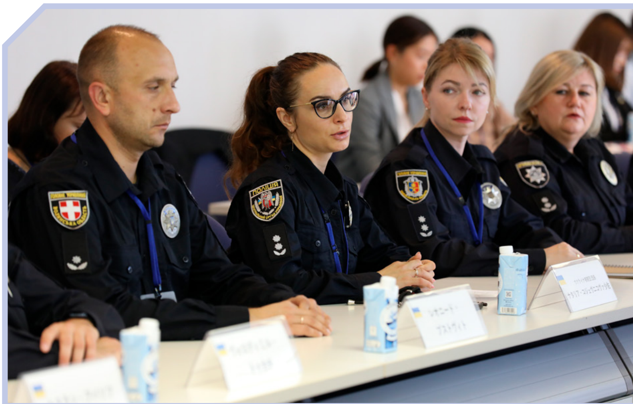
Fifteen delegates from the National Police of Ukraine and Ministry of Interior came to Japan in October 2023 to learn from experts of the National Police Agency of Japan about forensic techniques.