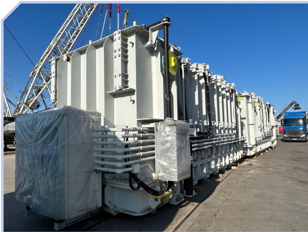
An autotransformer arriving in the port of Gdansk, Poland, on the way to Ukraine – September 2023.

UNDP has been supplying equipment and offering support to Ukraine's energy sector, fostering its transformative recovery, with a focus on: