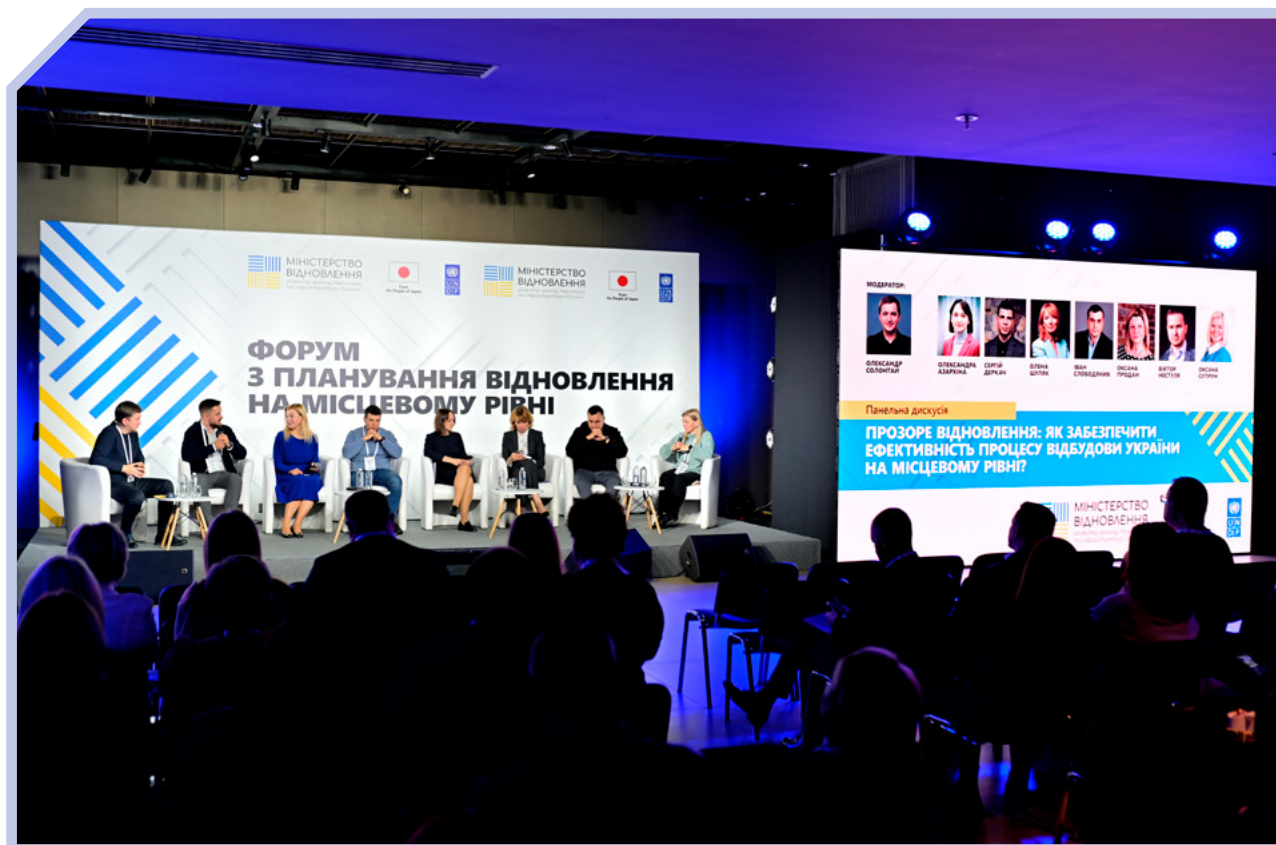
Local Level Recovery Planning Forum, Kyiv – November 2023.

UNDP supports the Government in integrating crisis management expertise, enhancing capacities for effective crisis response and aid delivery, improving the coordination of external assistance in crisis recovery, and strengthening government abilities in crisis communication and countering disinformation.