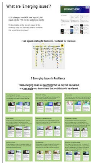
FTSS and Emerging issue Primer