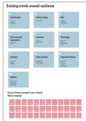
Top 10 trends