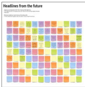
News from the future