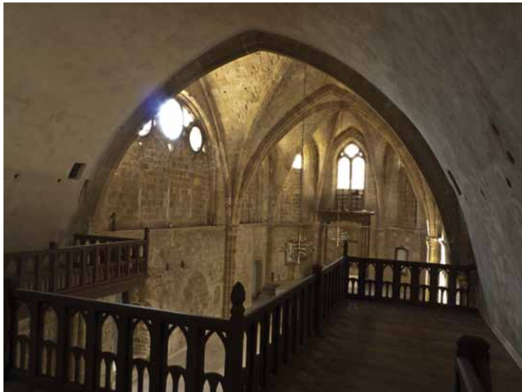
Fig. 26 Church interior after the restoration.

Everyone involved in this undertaking recognized that it was much more than a routine cultural heritage project. Restoring the monument was obviously rewarding for its own sake, but the revitalized space is also both an example of, and an opportunity for, inter-communal harmony. Furthermore, the transfer of skills and knowledge and the building of local expertise will have a long-term durable impact on cultural heritage in Cyprus. The project illustrates how people with a shared vision can achieve the seemingly impossible. It also illustrates the value of embracing participatory approaches at every stage of the undertaking.