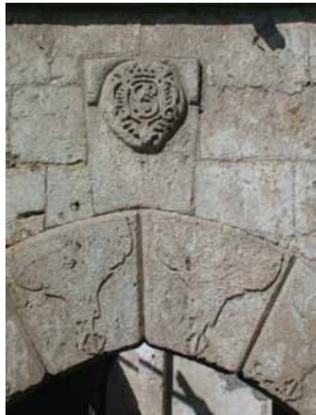
Fig. 8 This carved stone gate marked the entrance to the beautiful and well-fortified Melikian mansion. By the sixteenth century much of the original Benedictine monastery had been dismantled and the stones were used in new buildings. (BCD Progetti)