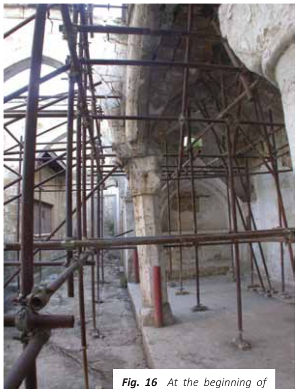
Fig. 16 At the beginning of the project, the porch was in imminent danger of collapse. Every one of the pillars was slanted, and the buttresses were cracking.

Structural decay had seriously damaged the porch, which was near to collapse. The pillars had been gradually overturned by the thrust coming from the heavy load of the vault and the roof above. This slow but steady pressure had distorted the overall geometry of the vault and some of the wedge-shaped stone voussoirs, which form part of the arches, had fallen or were about to fall. All the columns of the porch were visibly inclined outwards. Structural decay was also visible on the north side of the church. The most serious problems were deep cracks in the choir's ribbed vault.