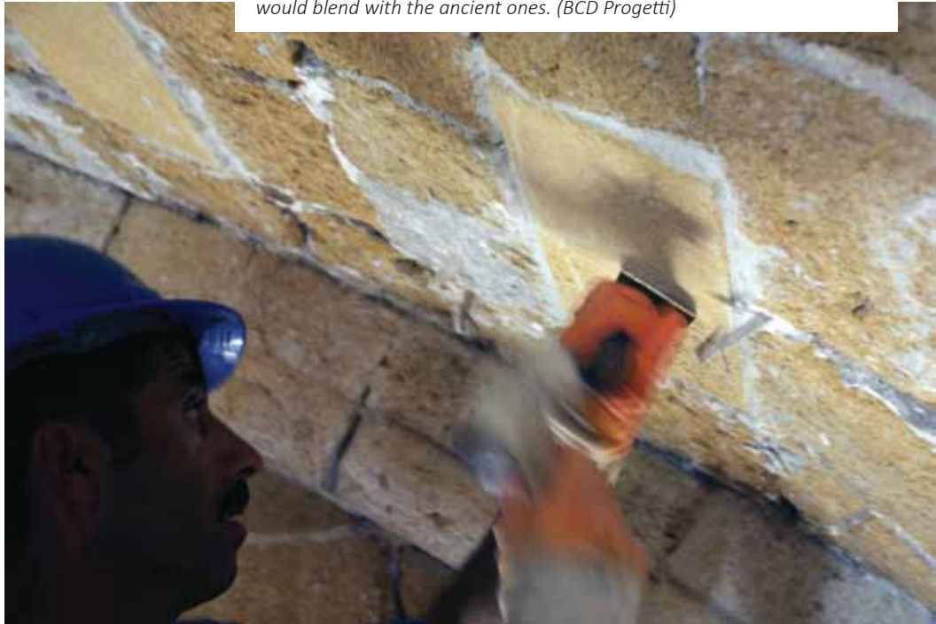
Fig. 23 Masons used coarse-tooth chisels to mimic the effects of historical stone-cutting techniques and weathering so that the new stone blocks would blend with the ancient ones.

For the interior surfaces, the aesthetic treatment took into account three considerations: the historical appearance of the interior, the need to integrate the fragmentary plasters from different historical periods, and the memories of the people who had used the site in their youth. The original fourteenth-century surfaces such as the walls, colonettes, ribs and vaults had been coated with a very thin painted lime plaster. The barrel vault and the porch, built some two hundred years later, had a much thicker plaster, much of which had been removed during the twentieth century. To preserve the aesthetics of the church, it was necessary to propose a finish that could match and preserve the historic plasters, while still matching the memories of the people who had used the church.