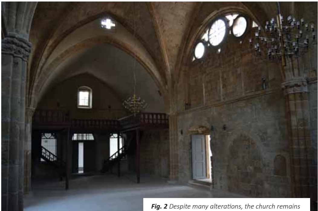
Fig. 2 Despite many alterations, the church remains an outstanding example of Cypriot gothic architecture. In the walls in the foreground of this photo one can see the outlines of the original fourteenth-century niches, which were filled in during the renovations in the early sixteenth century. The barrel vault in the background and the door on the north wall were added at the same time. (Vitti)

Grave stone slabs, originally inserted into the floor of the church, date from the fourteenth to the nineteenth century. The earliest graves stones, dated between 1312 and 1482, give us the name of the original monastery and its approximate construction date in the early fourteenth century.