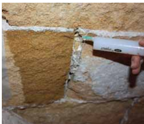
Fig. 22 Conservators injected liquid consolidants into the pulverised stones, to strengthen the decayed stone. This allowed the project to preserve many of the damaged original stones.

Stones with minor damage were consolidated and preserved; only stones that were disintegrating into fragments and dust, and thereby threatening the stability of the masonry were replaced. This respect for the authenticity of the fabric required a careful stone by stone examination before any decision regarding consolidation or substitution was approved. This minimum intervention strategy was applied to all surfaces, but the substitution of the stones on the exterior surfaces was more extensive, due to climatic factors, which both increased the weathering of the stone and reduced the penetration of the consolidating material.