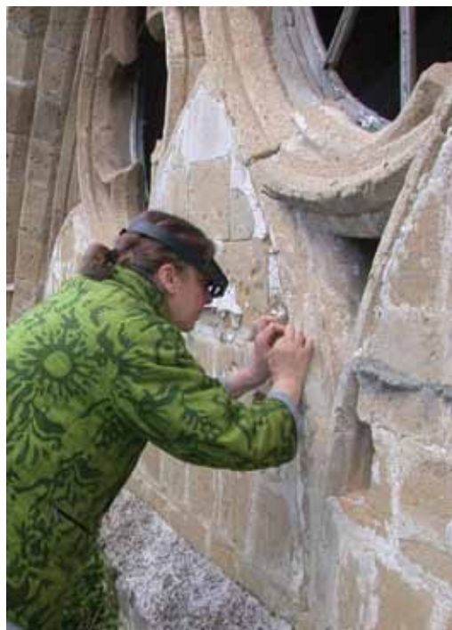
Fig. 20 A conservator from the Istituto Centrale del Restauro tests the original plasters during the Assessment of the Church. One of the most technically challenging tasks was to remove the modern plaster that was damaging the underlying stone, without damaging the traces of older plaster beneath it. (Vitti)

Once the plasters were carefully removed, the stone surfaces had to be cleaned. Given the time-consuming nature of cleaning the stone manually, a modified sand-blasting procedure was tested and approved. At the end of this stage the entire stone surface was completely clean and it was possible to proceed to the next stage: the consolidation or substitution of the crumbling stones.