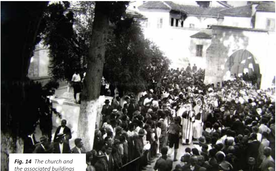
Fig. 14 The church and the associated buildings and spaces were the centre of the Armenian community and were used for educational and social purposes as well as religious ones.

These challenges were shared with the stakeholders and with the communities with historical ties to the site, and the final design proposal was a result of these collaborations. The aim was not to return the church or the site to its original state, but to preserve the rich historical layers contained within the site. Each historical transformation was given equal value; together they express the unique history of the monument. The only exceptions to this approach were some additions that were physically and chemically incompatible with the preservation of the underlying stonework. In the end, the proposal contained four different types of interventions: conservation, restoration, reconstruction and, in very limited cases, reversal of those previous interventions that may have compromised the structure.