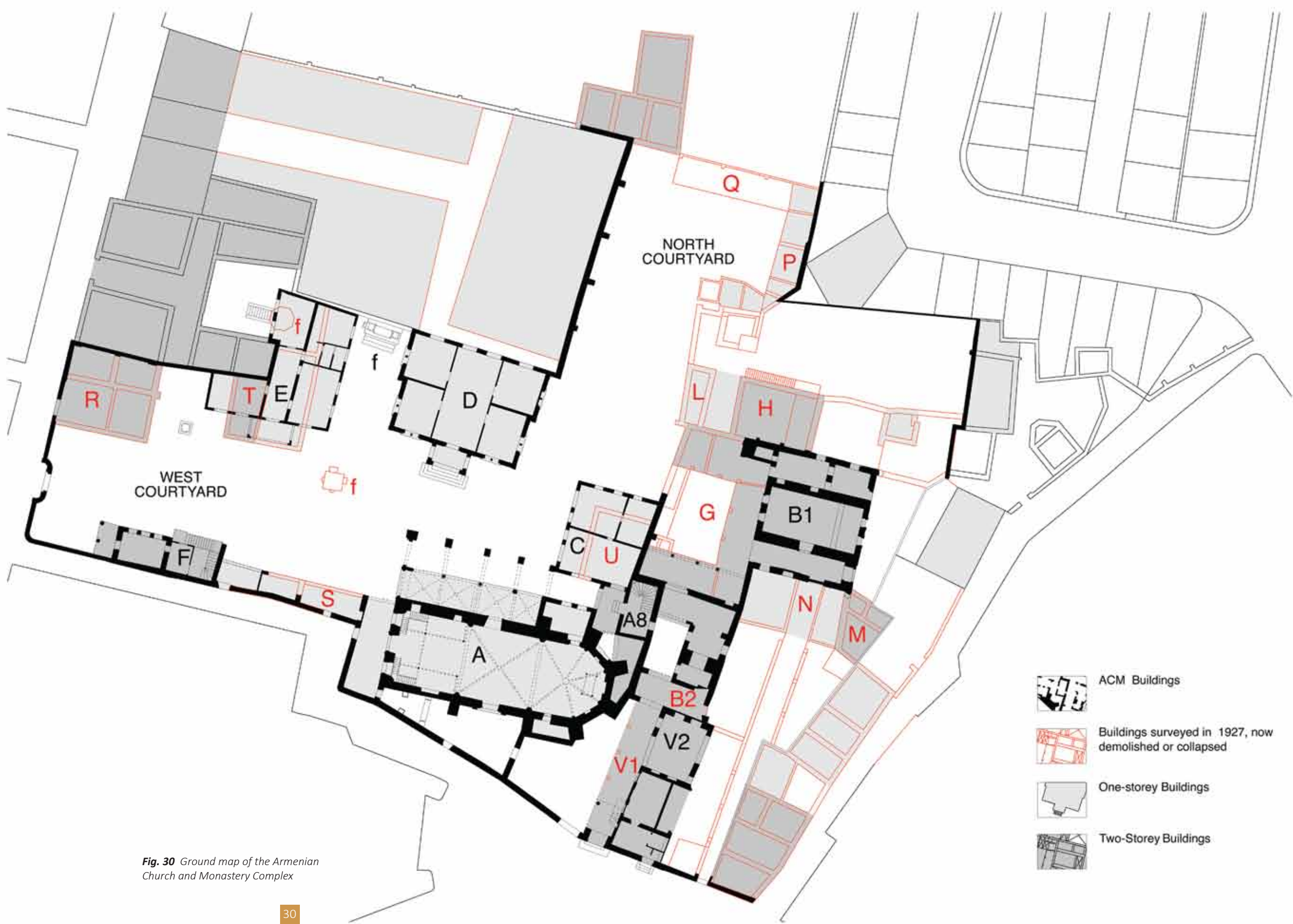
Fig. 30 Ground map of the Armenian Church and Monastery Complex