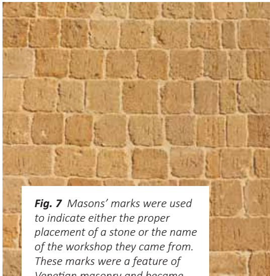
Fig. 7 Masons' marks were used to indicate either the proper placement of a stone or the name of the workshop they came from. These marks were a feature of Venetian masonry and became common in Cyprus in the sixteenth century along with many Venetian architectural motifs. (UNDP-ACT)

By the time of these renovations, the ancillary buildings of the monastery had been dismantled and the remains of these buildings were used in the construction of new houses. The Melikian Mansion, a house to the east of the church, was built by a wealthy merchant around the sixteenth century. It is distinguished by a well-protected storage/treasure room on the ground floor, an arched loggia on the first floor and a nicely carved arched stone gate on the same side as the loggia.