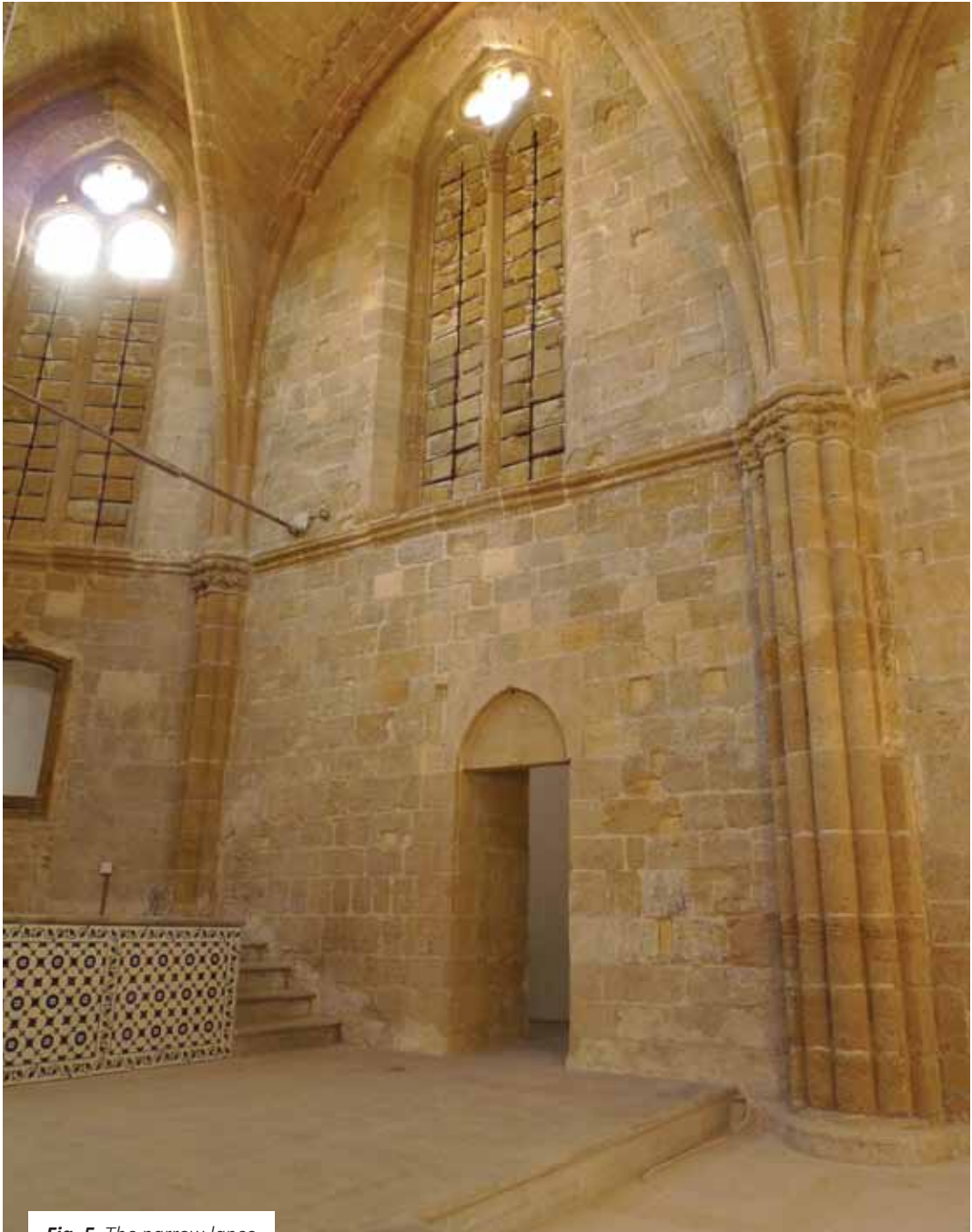
Fig. 5 The narrow lance shape of these windows and the decorative, four-leafed quatrefoil tracery are classic features of gothic ecclesiastical architecture. (Vitti)

A cornice divided the windows from the lower wall which was punctuated by niches, one of which can be identified as the original location of the tomb of Abbess Eschive de Dampierre (d. 1340), now located on the northern porch. This tomb is one of the few surviving masterpieces of Cypriot gothic funerary art. The carved relief of the Abbess and her coat of arms is crowned with a gabled cornice and was originally shaped to fit into one of the wall niches.