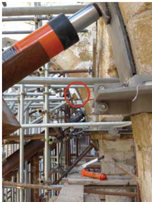
Fig. 19 The project engineers invented a technique using hydraulic jacks to literally push the collapsing sixteenth-century porch upright, one centimetre at a time. The circle in the picture shows the gap between the original prop, and the location of the arch after it has been slowly pushed back into place.

During the design phase, conservators tested several methods for removing the modern plasters from the interior surfaces of the church. These trials were essential to ensure that the adherent cement plasters could be removed without further damaging the decayed stone. The conservators also needed to detect and preserve the rare and extremely thin fragments of the original fourteenth-century lime plaster.