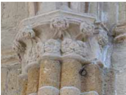
Fig. 3 Detail.

The earliest grave stones, dated between 1312 & 1482, give us the name of the original monastery