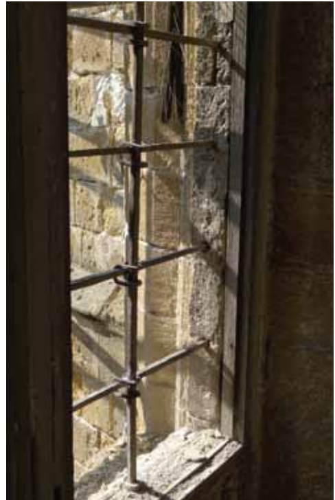
Fig. 24 These metal gratings supported a stained-glass window in the original fourteenth-century church. (Vitti)

Each stage of restoration revealed a wealth of new information about the site. Two unexpected discoveries were the gratings used in the original gothic windows and two painted bosses on the key of the vault. The former, exceptionally important for Cypriot gothic architecture, were the original metal gratings that supported the gothic stained glass. These gratings had been visible before the intervention, but had been interpreted as modern gratings. The removal of the gypsum plasters used to wall up the windows revealed that these gratings ran the height of the window and belonged to the original fourteenth-century church. These are, to our knowledge, the only known examples of stained glass window supporting structures in Cyprus. The metal was treated to preserve it for years to come.