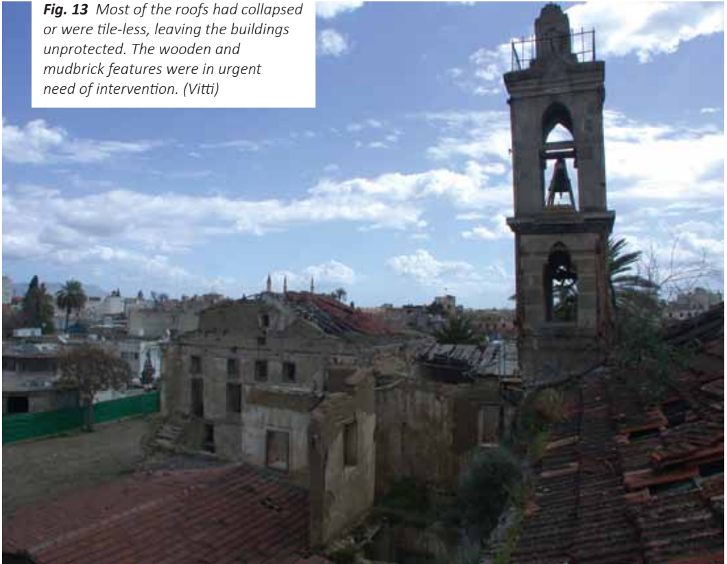
Fig. 13 Most of the roofs had collapsed or were tile-less, leaving the buildings unprotected. The wooden and mudbrick features were in urgent need of intervention. (Vitti)