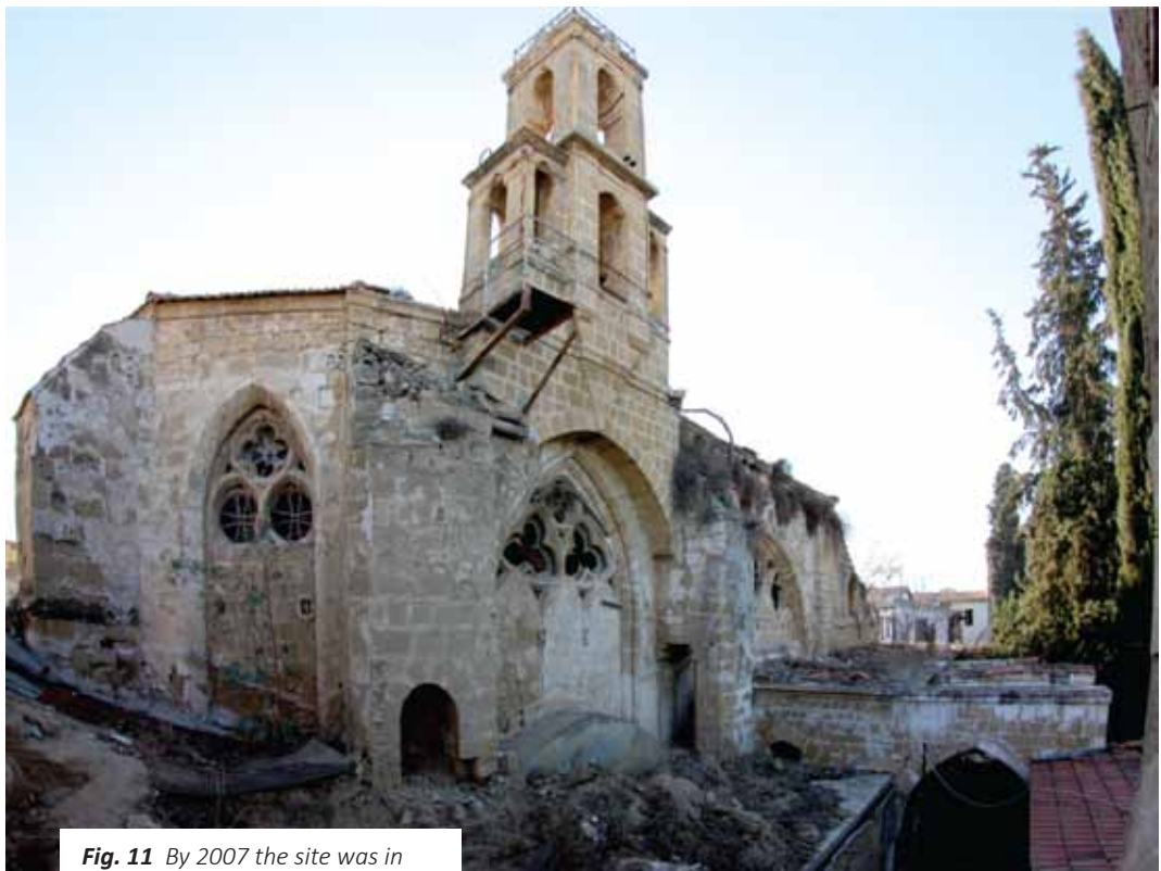
Fig. 11 By 2007 the site was in urgent need of attention. As a first step, the historical and cultural importance of each building was assessed, as well as its state of repair. (BCD Progetti)

The restoration project was developed in a uniquely participatory manner. A wide range of stakeholders, including the Armenian community in Cyprus, were involved in every step of the project. One of the project goals was to facilitate the capacity building of local expertise, so in addition to continuous interaction between the design team, the stakeholders, and the conservation and restoration workers, two technical workshops were conducted on site.