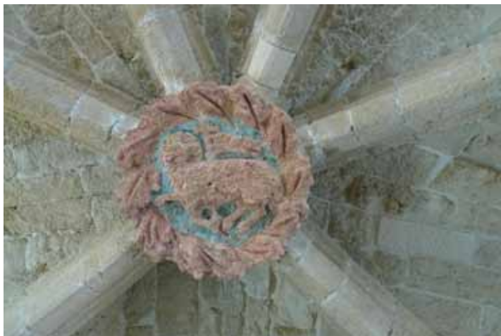
Fig. 25 The removal of thick layers of gypsum plaster from the bosses, on the ceiling revealed two intricately carved surfaces. The most elaborate design was an agnus dei. This 'Lamb of God' is a common Christian symbol. (Vitti)

The second discovery was two decorated bosses. After removing the thick gypsum layer from the key stones at the intersection of the vaults' ribs, two delicately carved surfaces came to light. The boss at the intersection of the second bay is a simple pattern with leaves that circle the central area, while the boss above the choir is an impressive agnus dei. This "Lamb of God" is represented in the traditional form of a lamb looking backwards, holding in its right foreleg a Christian banner with a cross.