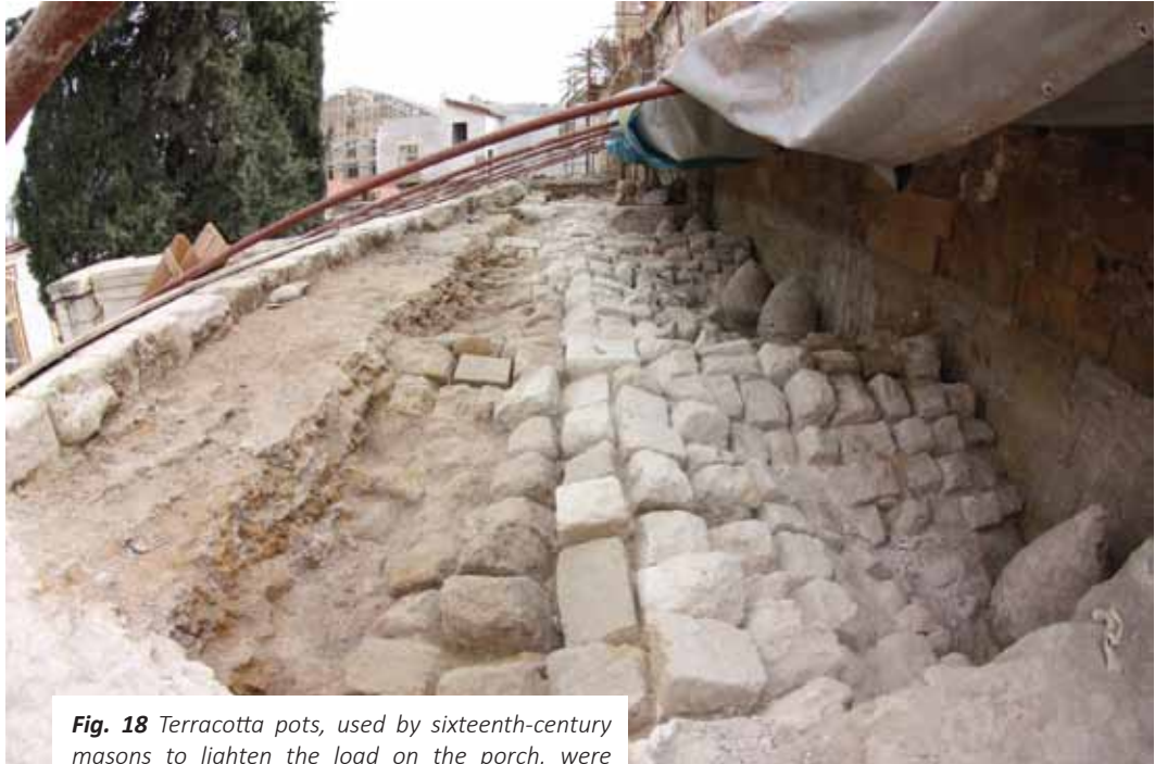
Fig. 18 Terracotta pots, used by sixteenth-century masons to lighten the load on the porch, were discovered when the heavy terrace floor, seen on the left of the photo, was removed.

The first step in this process was to shore up the vault; the next step was to decrease the substantial weight of overlying fill, to prevent the porch from slowly collapsing again. Like every other part of this project, this led to unexpected discoveries. When the team dismantled the floor of the terrace, which formed the roof of the porch, they uncovered a series of terracotta pots, which had been used by the original builders in an attempt to lighten the weight on the supporting structure. These pots have been protected and left in their original location.