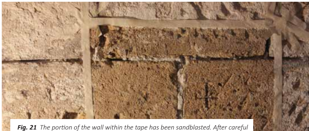
Fig. 21 The portion of the wall within the tape has been sandblasted. After careful testing, this technique was used to remove the last thin layer of modern mortar that could not otherwise be removed without harming the stone. (BCD Progetti)

As the project progressed it became clear that over the years the addition and removal of plaster and other materials, and the humid conditions, had so damaged the original stonework that some degree of stone restoration and even replacement was necessary. The most damaged stones were found on the southern exterior surface and the interior vaults. Different intervention strategies had to be devised for these two areas.