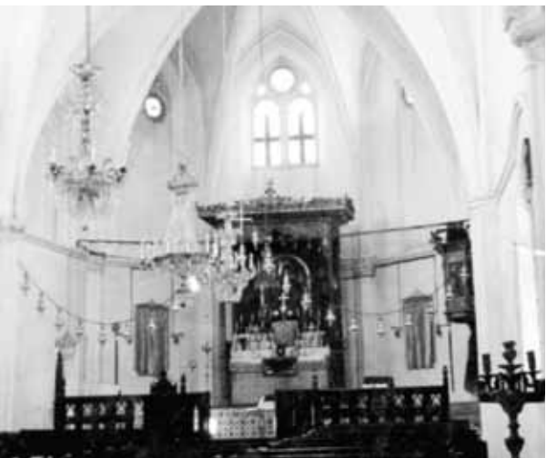
Fig. 10

Throughout much of the twentieth century the Church and the surrounding complex were used by the Armenian community for religious and cultural purposes. Due to its proximity to the buffer zone, which was established in Nicosia following intercommunal tensions in 1964, the site was largely abandoned and by the time the UNDP project began in 2007 the building had not been used as a church for decades.