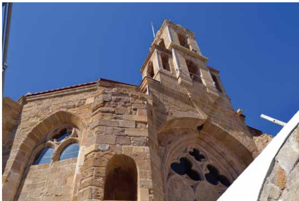
Fig. 15 The belfry and the buttresses were the last major additions to the church. (Vitti)

Following this plan, the area between the church and the Victoria street doorway, an area used for both social and religious events that was already partially paved, was given a new stone paving. In addition, a tamped earth paving now links the northern courtyard, via a new gate, to the adjacent public space. The new access highlights the nineteenth-century belfry built on the north elevation of the church and located just in front of the new gate. The wall that originally separated Melikian's Mansion from the rest of the site will be rebuilt to restore the third courtyard.