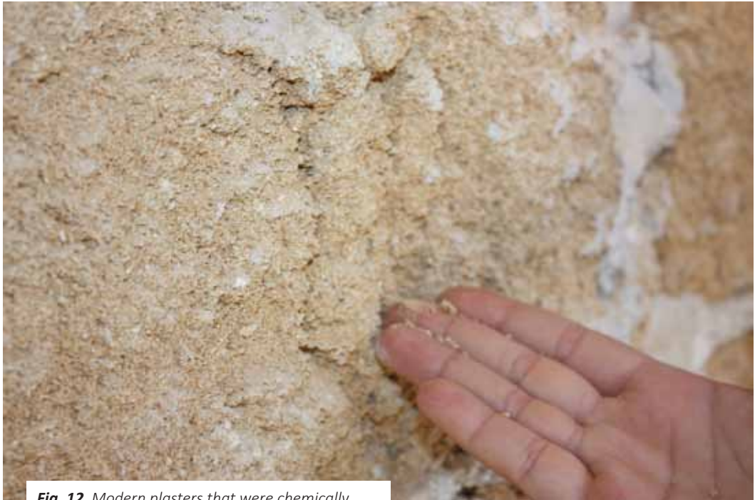
Fig. 12 Modern plasters that were chemically incompatible with the sandstone, cement mortar repairs and the humid climate of Nicosia together reduced some blocks to dust.

When the design phase began in 2007, large portions of the site were in need of immediate intervention, while others had already collapsed. The church, with the possible exception of the northern porch, had not suffered serious structural damage. However, broken and missing windows and a leaking roof, combined with the humid climate, had created the circumstances for heavy material damage. In addition, the gypsum and cement plasters used in previous renovations and repairs had damaged both the interior and exterior walls. Some of the soft sandstone blocks were crumbling and intervention was needed to prevent further deterioration.