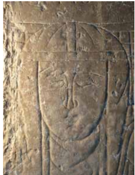
Fig. 4 A rare example of Cypriot gothic funerary art, the carved relief of the Abbess Eschive de Dampierre was originally shaped to fit into a niche inside the church. (Vitti)

Even after extensive remodelling and renovations over seven centuries, the fourteenth-century church remains a fine example of Gothic architecture and retains many of its original features. It originally consisted of a single nave divided in two bays, and a polygonal choir covered by ribbed vaults. The windows on the southern side, to the right of the entrance, were smaller than those to the north, to protect the interior from the hot local sun. The choir had typical gothic windows: lancet shaped, divided by a central vertical post called a mullion, and surmounted by a four-leafed quatrefoil design. The original windows were stained-glass, and the walls were covered in plaster painted with blue and red lines to mimic ashlar masonry. The gothic interior, with large windows and white plaster walls would have been full of light.