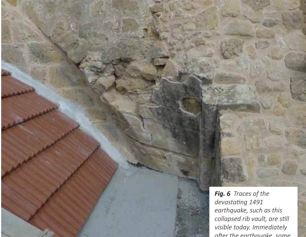
Fig. 6 Traces of the devastating 1491 earthquake, such as this collapsed rib vault, are still visible today. Immediately after the earthquake, some parts of the church were walled off or only partially repaired. The once wealthy Benedictine monastery may have been losing influence by the end of the fifteenth century. (Vitti)

In the 1491 earthquake the first bay's ribbed vault and the entire western facade collapsed. Traces of this devastating event, such as the ruined northern wall and part of the collapsed ribbed vault, are still visible today, despite many subsequent renovations. The initial repairs included a wall separating the ruined first bay from the rest of the church and a new access door on the south wall. The church continued to be used in this semi-derelict state for some time.