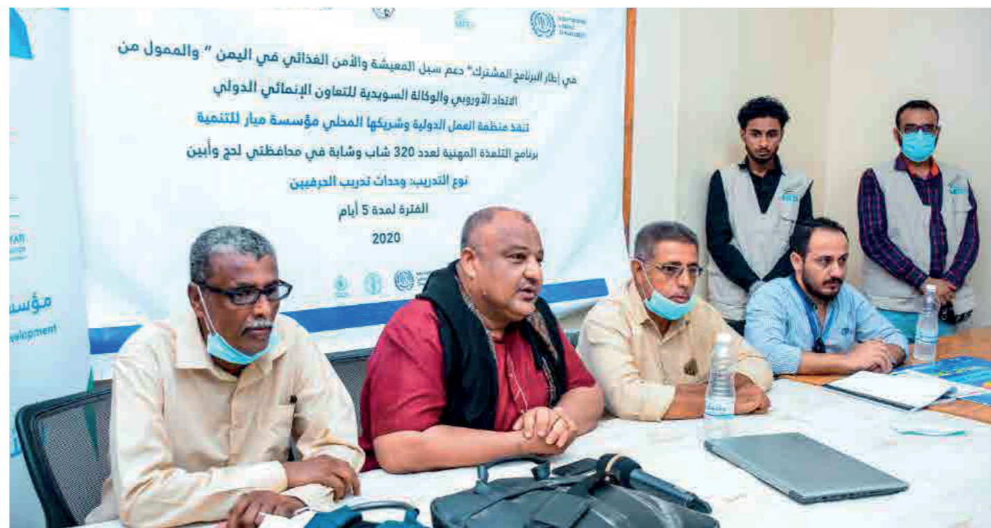
Lunching Craftsperson's Training Programme in Abyan

Under ERRYII Joint programme that is co-funded by EU and Sida, ILO and its local partner launched the craftspersons training programme in Abyan, in Khanfar and Zengbar districts at the district vocational Institute.