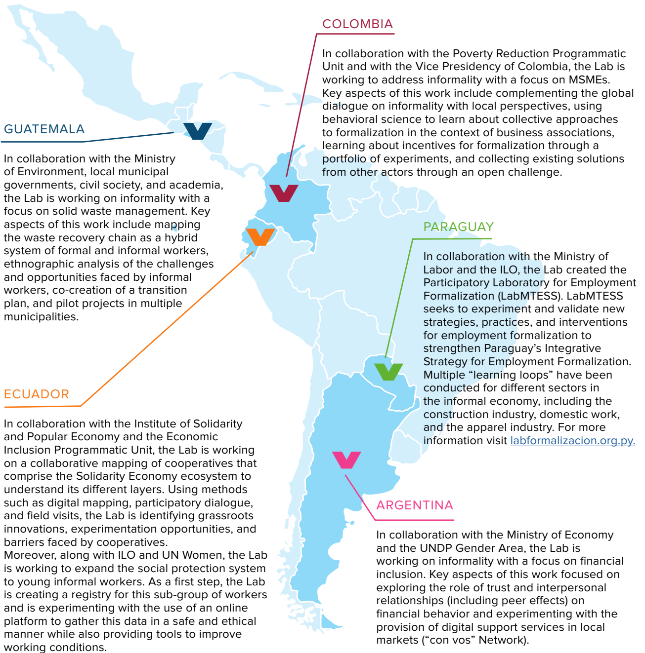
FIGURE 1. UNDP Accelerator Lab initiatives on informality in LAC